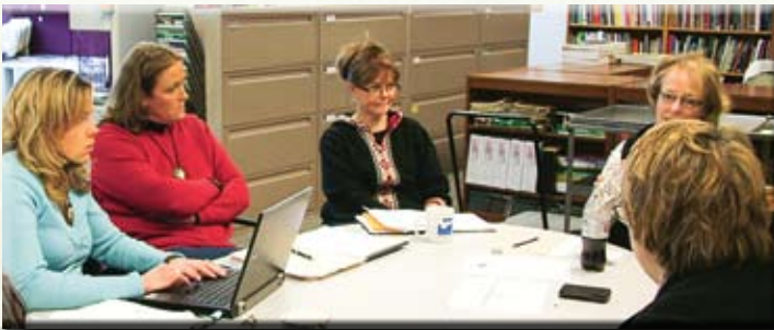
Response to Intervention