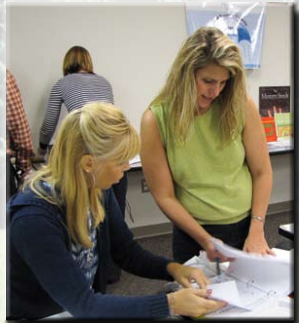
Hands on Science